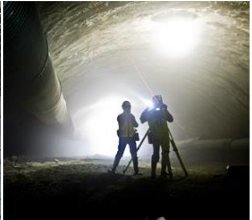
Caldecott 4th Bore Tunnel, Oakland